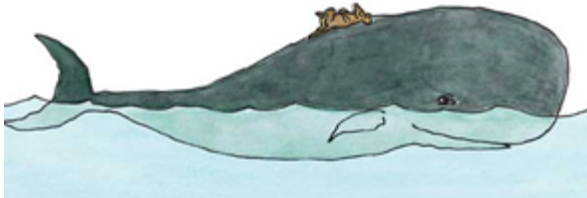
From the book Amos and Boris by William Steig

One of my former students said the word "classroom" should be called "classworld" because learning should happen outside of school too. I fully agree.