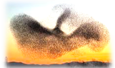
This is a starling murmuration

type in: 5stark2018-19.weebly.com . As we dig into the year, our 5S website will also include photos, interesting links, home/school connections, podcasts, and other information written and produced by you .